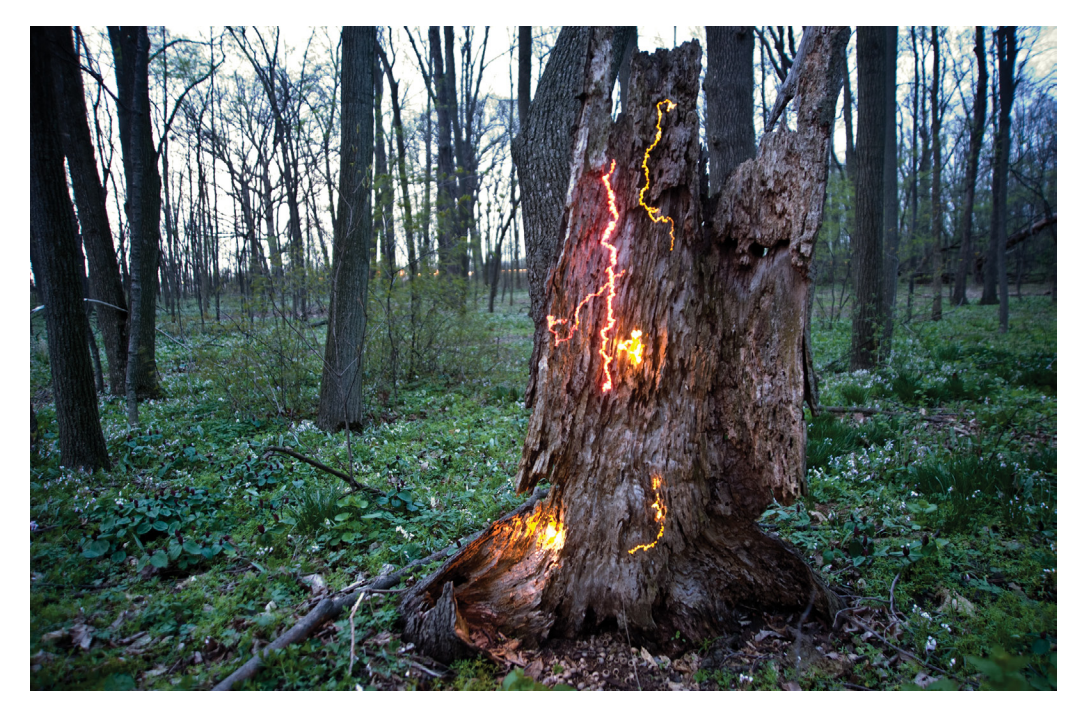
FIGURE 2: The images of the Beetles LED Backpack were taken between 1:00 p.m. and 3:00 a.m. central standard time in wooded areas of Ohio, Illinois, and Wisconsin.

This project is conceptually rooted within the notions of emergence, travel, and unrecognized path-making as well as my always-persistent desire to collaborate (albeit uninvitedly) with insects. We exist in a world that is dominated by highly advanced mapping and tracking