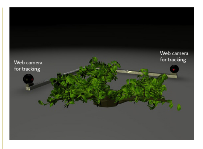
FIGURE 3, FIGURE 4, and FIGURE 5: Planning for the long-exposure capture of the bess beetles involved two primary concerns: the preparation of the environment for recording movement, and the preparation of the bess beetles for their role in providing a readable host. Here a 3D rendering of the capture set up, diagrams for installing the light emitting diode, and the actual, prepared bess beetle are depicted.

My goal is to discover ways that human beings may forge a positive relationship between insects based on the knowledge of how insects navigate space and form intricate societies. As humans we are instinctively drawn to animals that are closer to our own realm of experience—animals that are most often feathered or furry. We anthropomorphize many of the behaviors and responses of these animals, establishing an emotional bond with them, far more easily than we ever could with beetles or other insects. Often characterized as unthinking and unfeeling, insects rarely illicit from us the feelings of empathy we easily afford many other mammals. By making such small connections, such as recognizing emergent trends and travel characteristics, it is my hope is that the gap between the insect world and the human world becomes smaller.