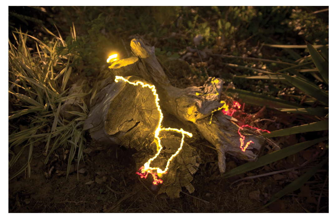
FIGURE 1: Through long-exposure photography, the pathways made by bess beetles were captured as they traced on the surface of a rotting tree trunk.

Track Series is an exploratory combination of ongoing photographic, videographic, and 3D motion capture