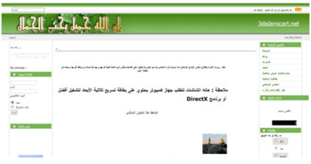
FIGURE 10: A screenshot of www.3dislamicart.net with a dominating green color scheme of the interface.

As human color perception is almost instantaneous and does not require an investigation at a more detailed level as more complex forms do, the color green becomes immediately distinguishable as a property of the artefact. In conjuction with the socially defined symbols, color defines additionally assigned qualities that "stand behind" the interface. From this perspective, the color green serves as a symbol of Islam and a second level signification of morality.