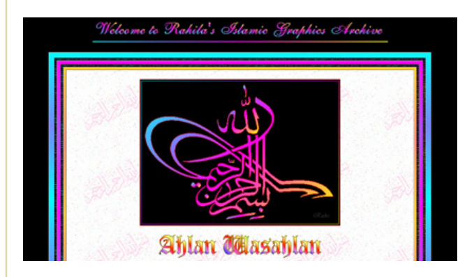
FIGURE 6: A screenshot of http://digiartport.net/daarulnaeem/main.html containing animated calligraphy in a Flash application.