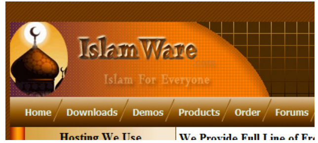
FIGURE 7: A screenshot of a part of www.islamware.com's site with an illustrated mosque cupola in the left top corner of the site.

on the identification with a cultural community. This is founded on the recognition of what is already known by the individual in contract to the relation between the new and the unknown that provokes a sense of uncertainty and consideration of possible negative events.<sup>12</sup>