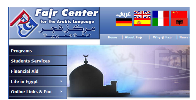
FIGURE 9: A screenshot of www.fajr.com with a photograph of a mosque near the center of the site.

FIGURE 8: A screenshot of a part of www.islamicity.com's website with a photograph of a mosque in the left top corner.