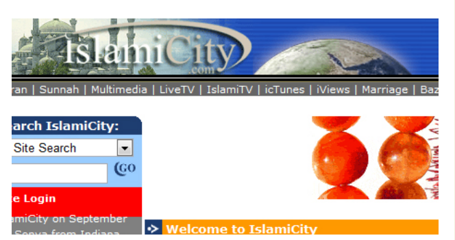
FIGURE 8: A screenshot of a part of www.islamicity.com's website with a photograph of a mosque in the left top corner.

FIGURE 7: A screenshot of a part of www.islamware.com's site with an illustrated mosque cupola in the left top corner of the site.